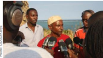
These reporters have been trained on how to report fairly and objectively on land disputes – a subject that often leads to violence in Kenya

The Land and Conflict Sensitive Journalism program trains Kenyan journalists from local and vernacular media outlets in how to report fairly and constructively on conflicts that are destabilizing Kenyan communities including land conflicts. The program is a response to the divisive role played by community radio broadcasters as mobilizers of ethnic hate during the 2007/2008 election violence. By building the hard skills and capacity of the partner media outlets through a broad package of support that includes training for key staff such as news editors and talk-show hosts, the program expands the quantity and quality of reports on conflict. The program focuses on improving reporting on land issues in the Coast and Rift Valley regions, enabling policy makers to address these concerns before they escalate into violence.